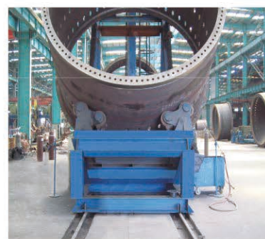
滚轮架应用 Turning-rolls application

Welding turning rolls has self-adjustable type, zoom type, flat wagon type, tiltable type and play-proof type. In standard configuration, an active one is combined with a passive one or several passive ones if the workpiece is too long.