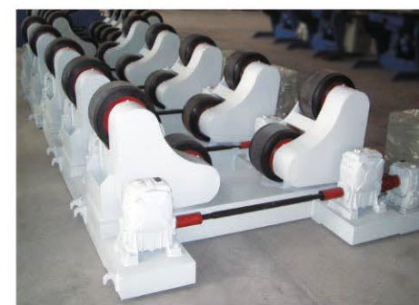
批量出口的滚轮架 Turning-rolls to Be Exported in batch